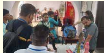
The security check pilgrim desk

Volunteers assisted with registrations, distributed information about the schedule of services, and providing guidance to pilgrims on