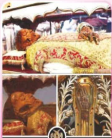
The Incorrupt Remains of Saint Francis Xavier