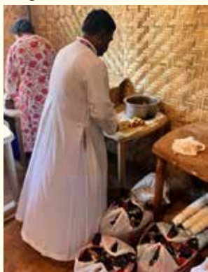
Anointed hands and culinary skills

Overall Reflections- Many parishioners expressed that their involvement deepened their faith and connection to the church community. Balancing long hours of service was demanding but ultimately rewarding. Volunteers felt privileged to serve during such a sacred event and were inspired by the devotion of the pilgrims.