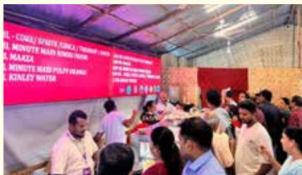
Hungry pilgrims queue for a bite at the cafeteria

Volunteers organised meal preparation, managed queues, and ensured hygienic and efficient service.