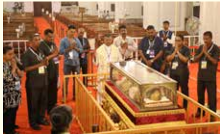
Security personnel and committee members venerate the sacred relics as the Parish Priest pray's the closing prayer for the day

Managing large crowds was a logistical challenge, but teamwork and preparation ensured a seamless flow.